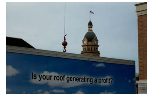
Trumbull County Solar Photovoltaic System JFS

Contact us for details & more information!